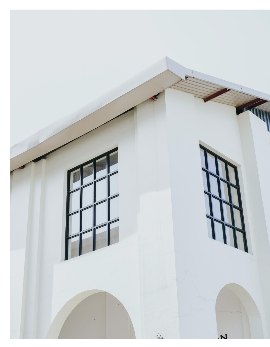
De Tjolomadoe Museum - Surakarta